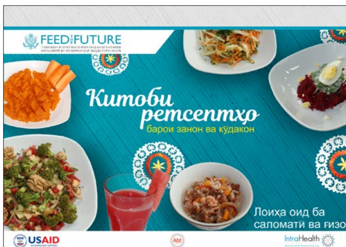
Figure 2. THNA's book of nutritious recipes for women and children

Community support groups: THNA established, for the first time, four types of peer-support groups, at least one in each of 500 communities: